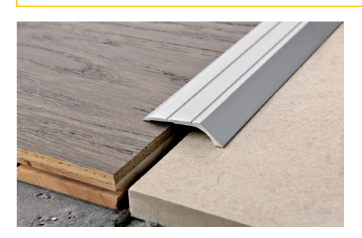
ANODIZED ALUM, with adhesive thermo packed

ANODIZED ALUMINIUM WITH SELF-ADHESIVE AND PUNCHED